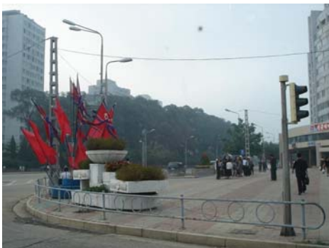
Street scene in Pyongyang

North Korea offers interesting business opportunities in several fields, such as software development, production of computer games, animation and cartoons, data entry en digitization. In order to provide detailed information about the IT opportunities in North Korea, a unique IT Study Tour will take place from 20 – 27 October 2007.