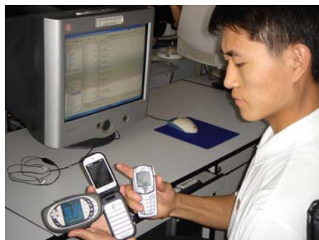
Programming mobile computergames