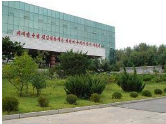
Software company KCC in Pyongyang

Indian software companies started offering their services to European clients more than twenty years ago. This country is the most popular offshore destination.