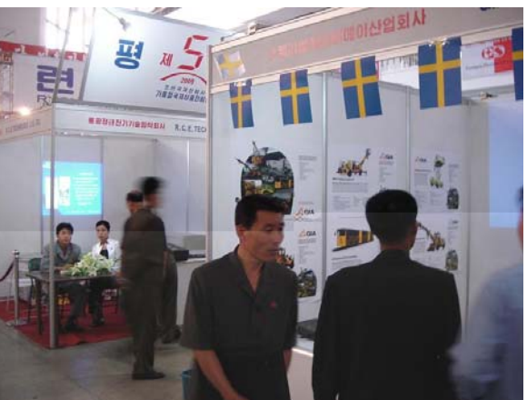
General impression of the Trade Fair (September)