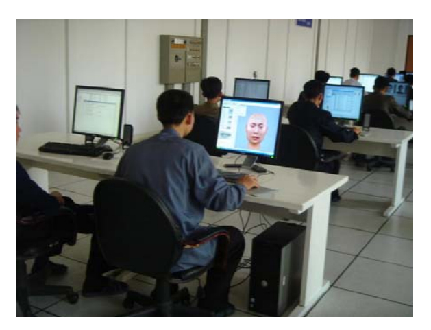
Visit to a software company