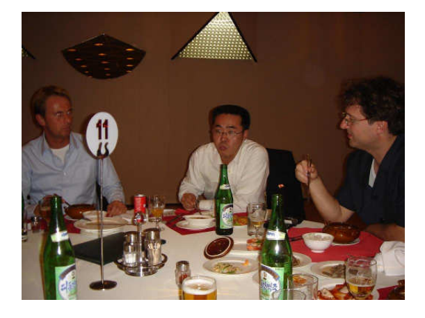
Photo: at a local restaurant - an excellent place for informal business discussions

<u>Saturday 4 October</u> Departure from Pyongyang to Beijing. Some of the participants took the connecting flight to Amsterdam, while others decided to spent a few more days in China.