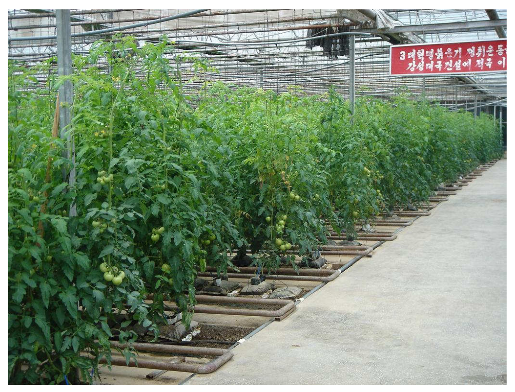
Photo: visit to a company in the field of agribusiness (greenhouse)

Photo: a friendly and informative business meeting