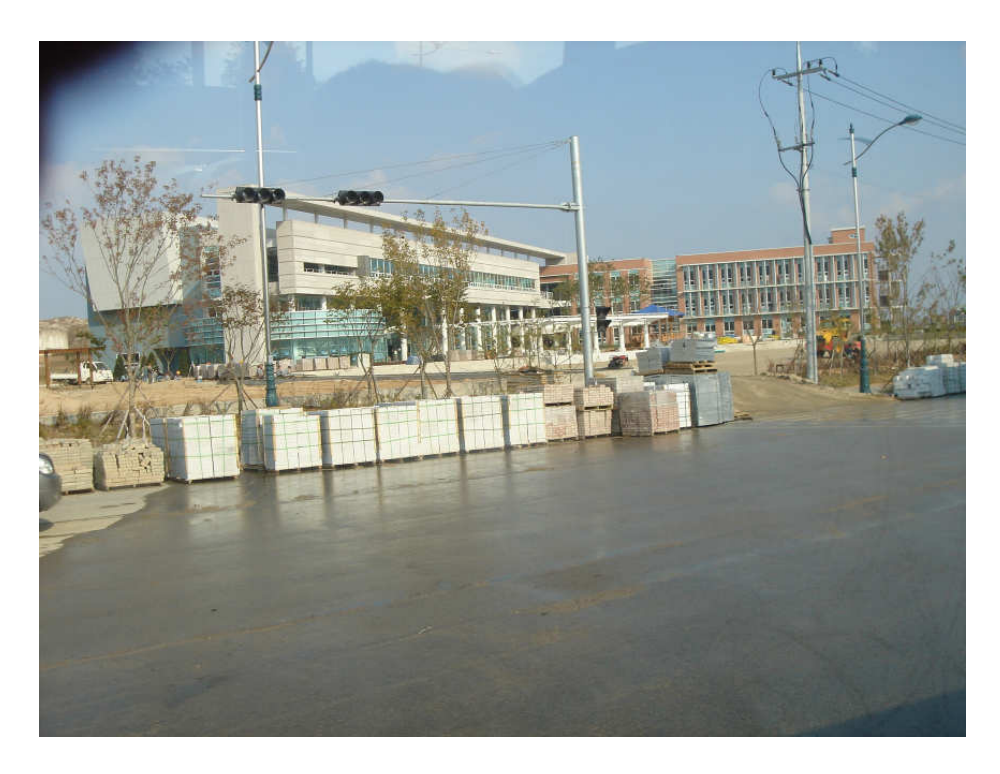
Photo (above and below): the rapidly expanding industrial zone at Kaesong

GPI Consultancy, P.O. Box 26151, 3002 ED Rotterdam, The Netherlands Tel.: +31-10-4254172, fax: +31-10-4254317 E-mail: info@gpic.nl, web: <u>http://www.gpic.nl</u>