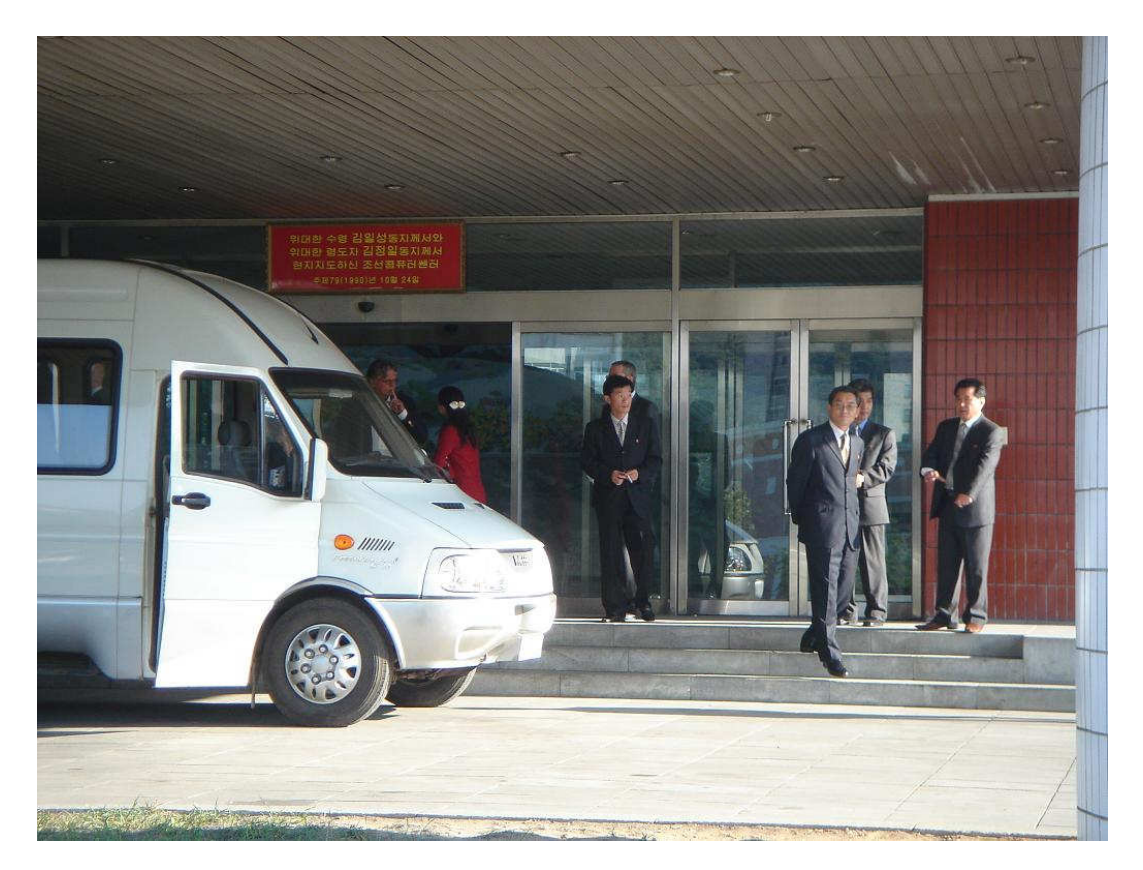
Photo: visit to a company in the field of Information Technology (Korea Computer Center)