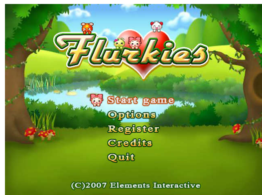
a mobile game made for a Dutch company