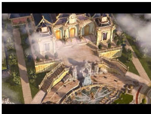
CG animation for a Chinese client