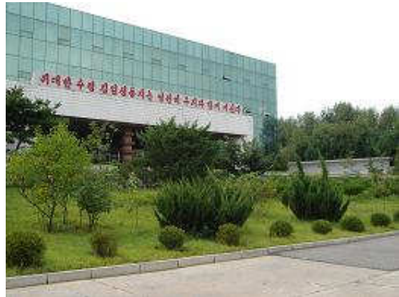
Software company KCC in Pyongyang

Indian software companies started offering their services to European clients more than twenty years ago. This country is still the most popular offshore destination.