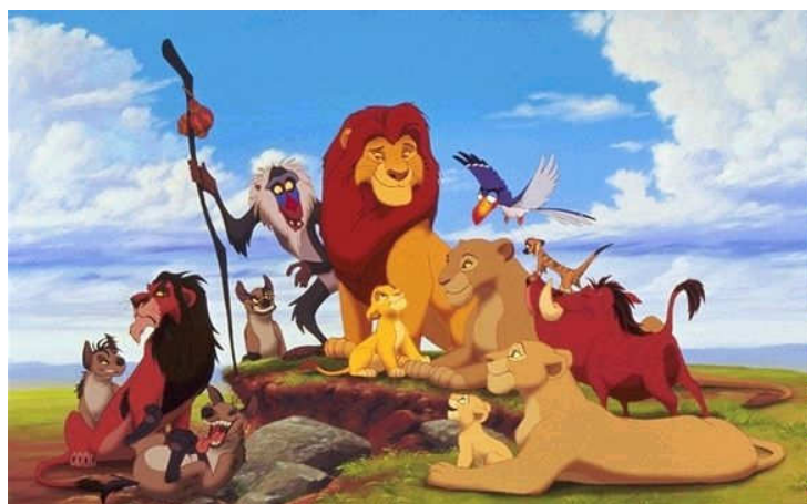
Pocahontas and the Lion King, (partly) produced for Walt Disney