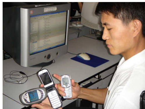
Programming mobile computer games