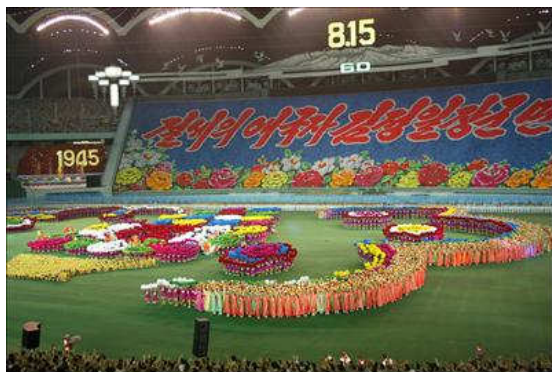
In a Pyongyang stadium: the Arirang massgame

China and North Korea offer interesting business opportunities in several fields, such as software development, production of computer games, mobile games, animation and cartoons, data entry and digitization. In order to provide detailed information about these IT opportunities, a unique IT Study Tour will take place from 27 September – 4 October 2008. A visit to the famous massgame Arirang can be included.