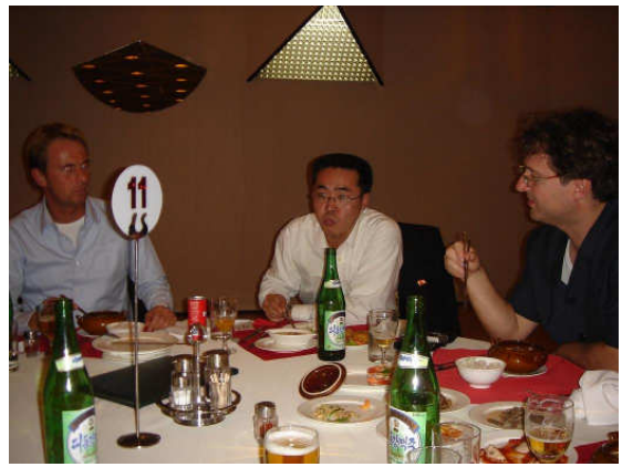
Photo: at a local restaurant - an excellent place for informal business discussions