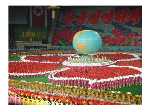
Photo: delegates of a previous mission attending the famous Arirang Massgame