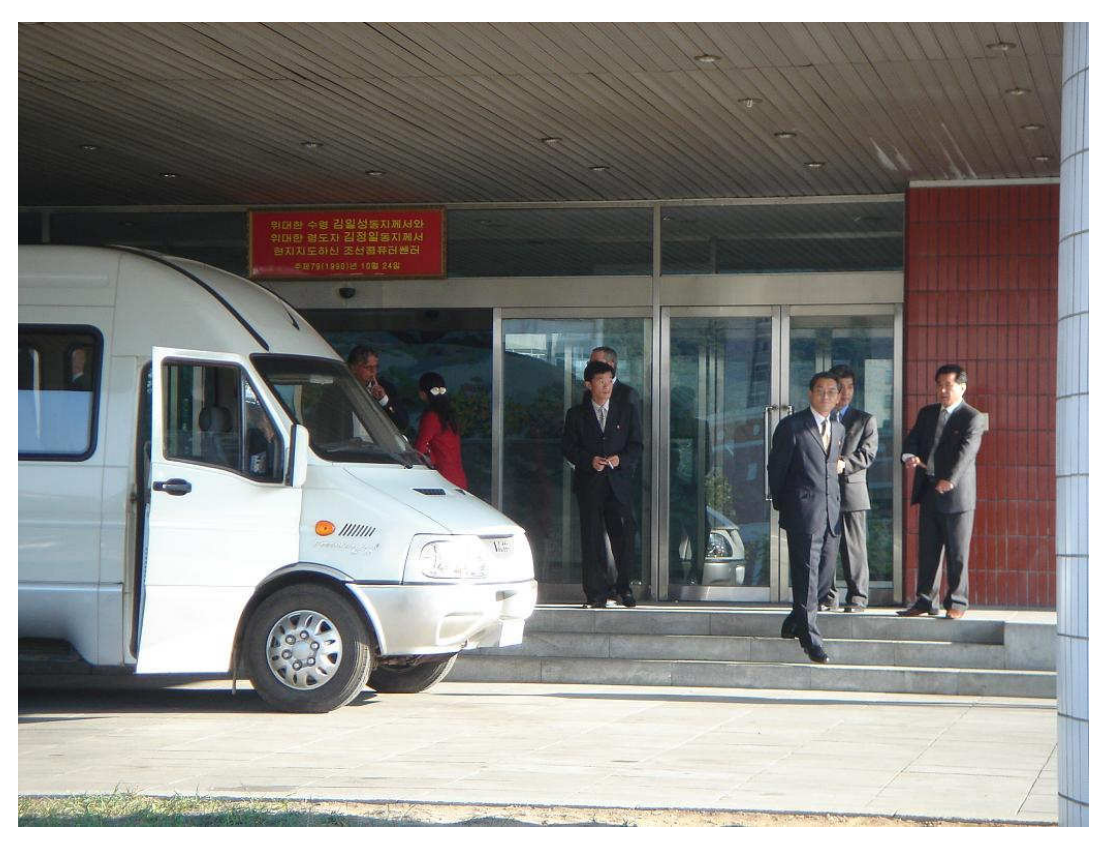
Photo: visits to companies in the field of Information Technology (e.g. KCC) are possible