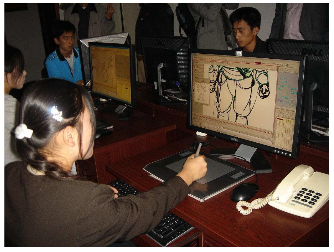
Photo: visits to companies in the field of animation (e.g. SEK) are possible