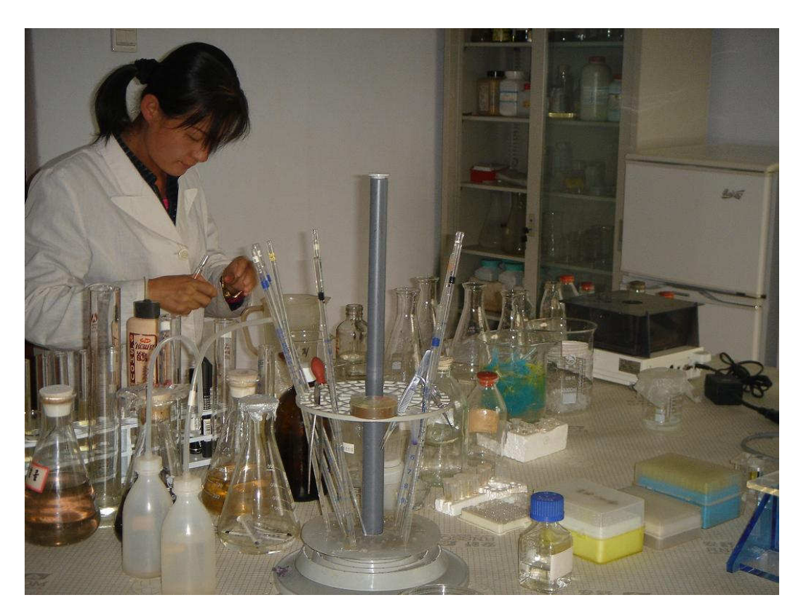
Photo: visiting a company in the field of agribusiness (research labs)