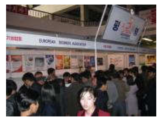
Included: a visit to the Pyongyang International Trade Fair