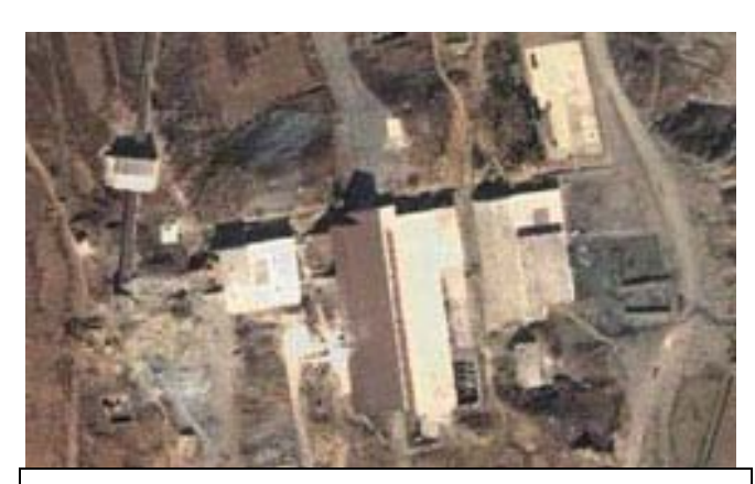
Figure 4: The Hyesan mine complex in North Korea.

nuclear test in May of that year. After the PRC assented to the sanctions, NHI Shenyang Mining Machinery, which was commissioned to build facilities for the mine, was reportedly forced to stop construction.<sup>21</sup> However, in July 2010, a spokesperson from Wanxiang Group stated that the mine's development work is continuing.<sup>22</sup> Furthermore, a recent press release from Jilin's provincial government referenced "current negotiations" between China and North Korea over copper and gold mine projects, 23 which may represent in part an indirect reference to the Hyesan mine project.