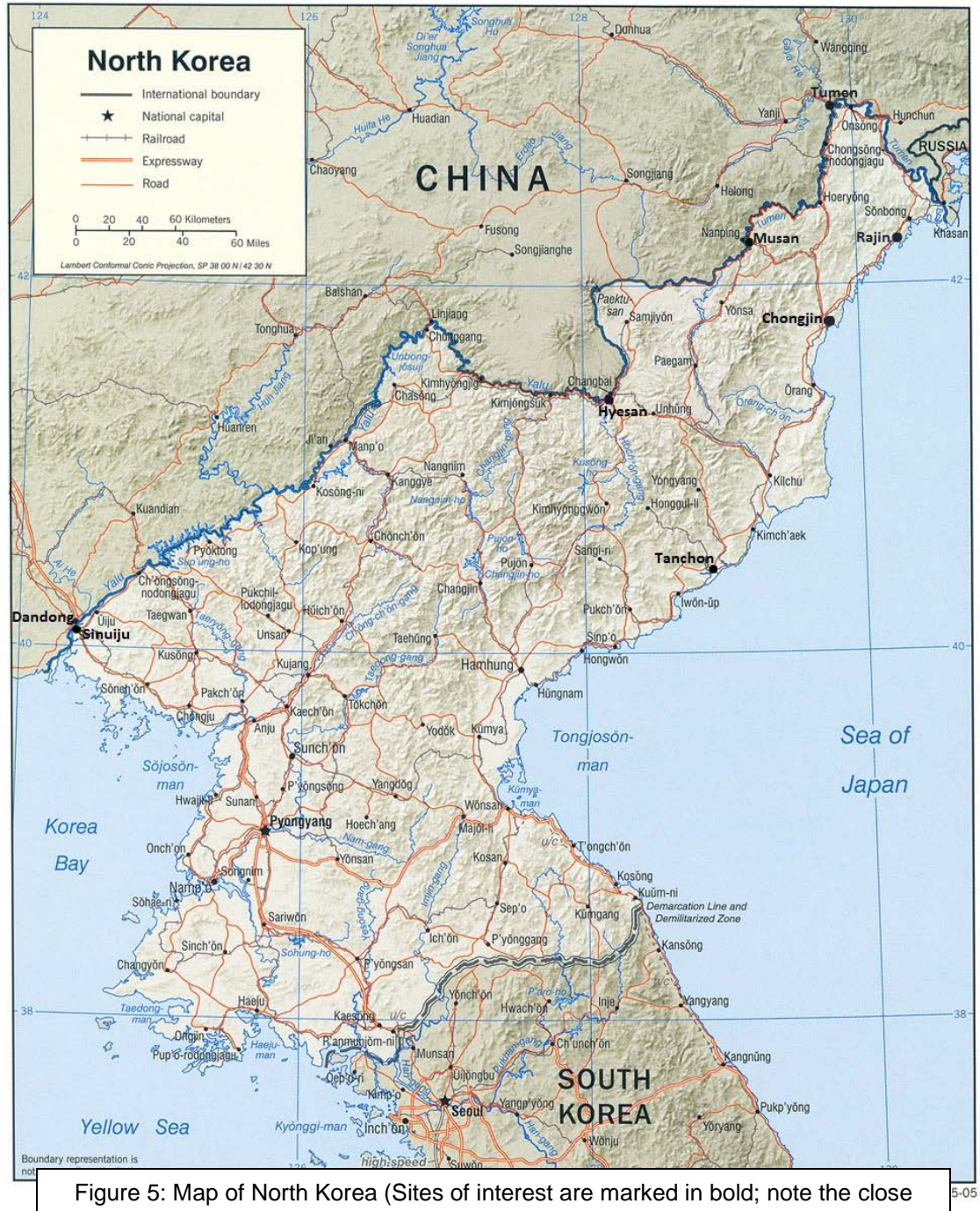
Figure 5: Map of North Korea (Sites of interest are marked in bold; note the close proximity of most investment projects to the Chinese–North Korean border.)

company to mine gold from the DPRK's Mt. Sangnong, located 50 kilometers from Tanchon in South Hamgyong Province on the eastern coast of North Korea and to ship all the mined gold concentrate to Zhaoyuan in China's Shandong Province for smelting. Five other North Korean gold mines have also garnered the interest of various Chinese mining companies, although the extent of their investment in them is unknown.<sup>26</sup>