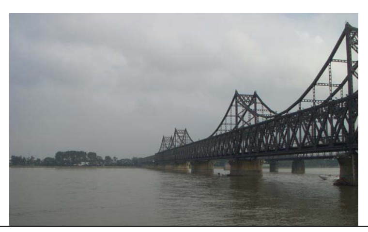
Figure 7: The "Friendship Bridge" over the Yalu River, which connects China and North Korea.

In the latest sign of closer economic relations between North Korea and the PRC, Chinese authorities agreed in October 2010 to allow hundreds of North Koreans to work in factories in the border cities of Dandong and Tumen. The factory workers will be assigned to a plastic processing plant, the products of which will be shipped by rail to Chongjin and eventually sold to South Korea and Japan. Tumen City is also hoping to attract more labor-intensive industries, such as apparel making, to capitalize on the new influx of low-cost North Korean labor.<sup>35</sup>