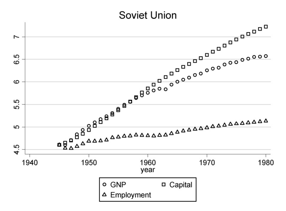
Fig. 2. Trends in output, capital stock and employment in the Soviet Union from 1945 to 1980.