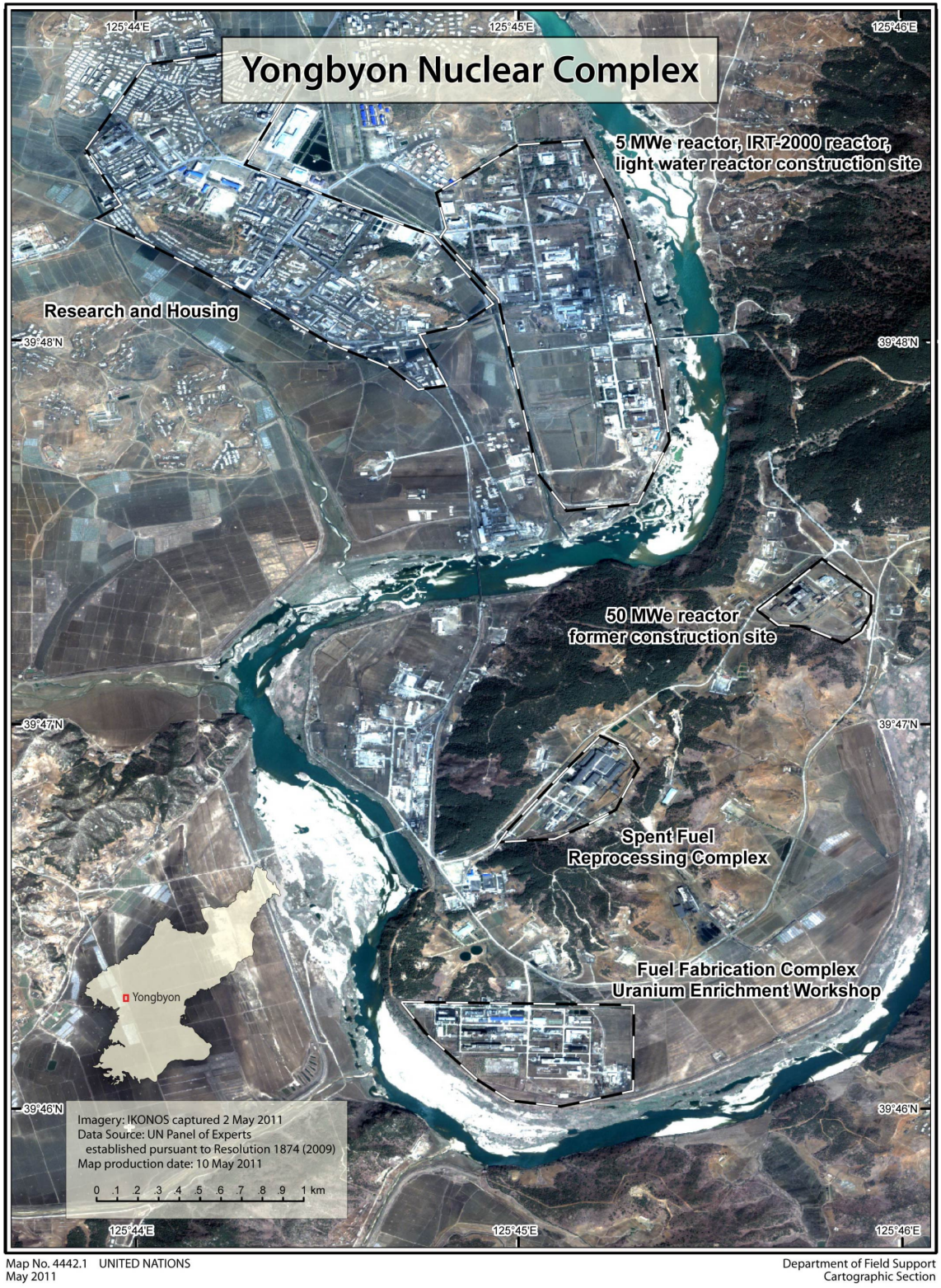
Annex A.1 Imagery of the Yongbyon Nuclear Research Centre