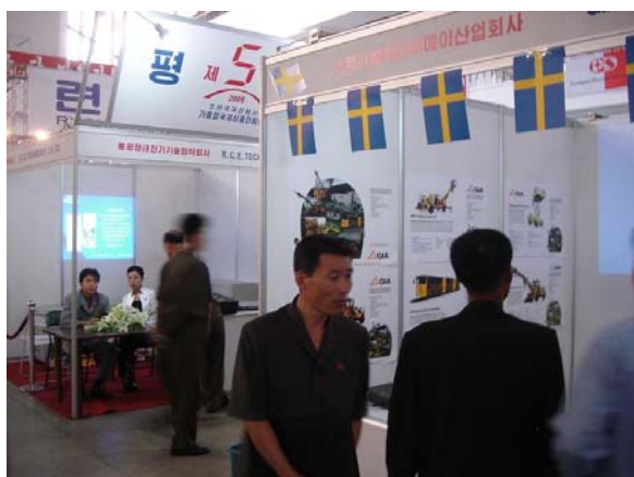
Booth of a company from Sweden