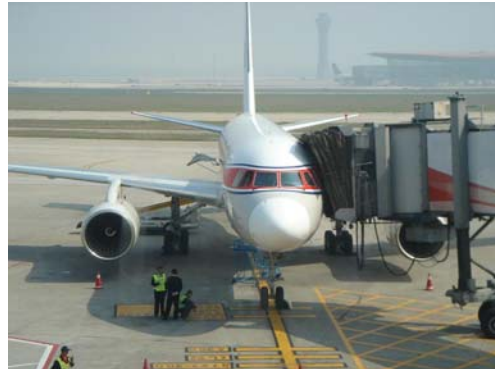
Photo: one of the new planes of Air Koryo

Arrival of European participants in Beijing (note: arrival at an earlier date is possible). In the evening, informal welcome reception and dinner at a local restaurant. Introduction to the business mission.