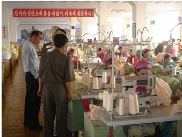
Visits to garments and fabrics factories