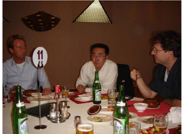
Photo: at a local restaurant - an excellent place for informal business discussions