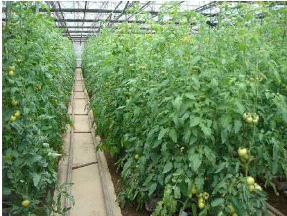
Visit to a greenhouse