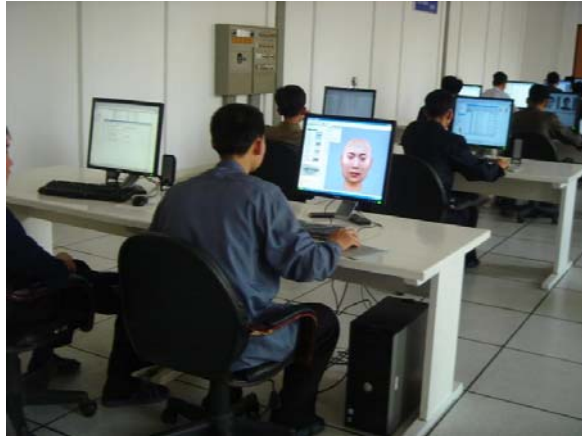
Visit to a software company