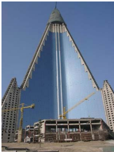
Photo: work on the Ryugyong Hotel

It established several free trade zones to attract foreign investors and there are several sectors, including renewable energy, garments, shipbuilding, agro business, fishing, horticulture, logistics, mining, stone processing, restaurants and Information Technology, that can be considered for trade and investment. DPRK is competing with other Asian countries by offering skilled labour at very low monthly wages. In particular companies with production facilities in China, where the wages are rising fast, are currently investigating alternative options in North-Korea.