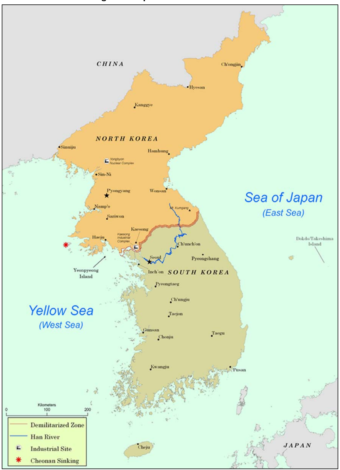
Figure 1. Map of the Korean Peninsula