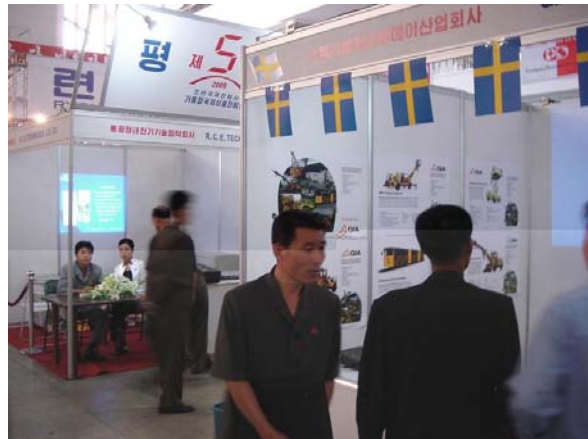
Booth of a company from Sweden