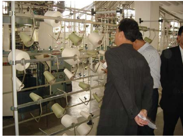
Visits to garments factories