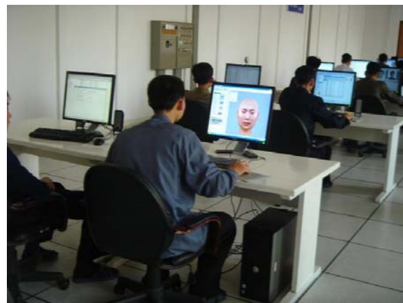
Visit to a software company