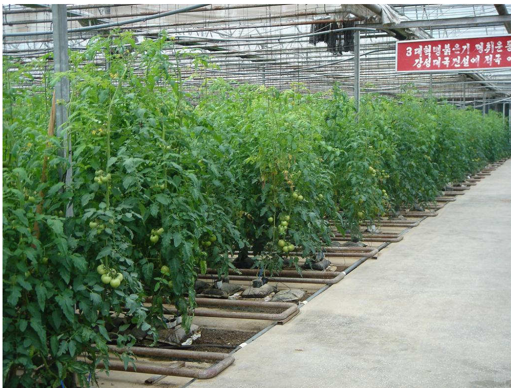
Photo: visit to a company in the field of agribusiness (greenhouse)