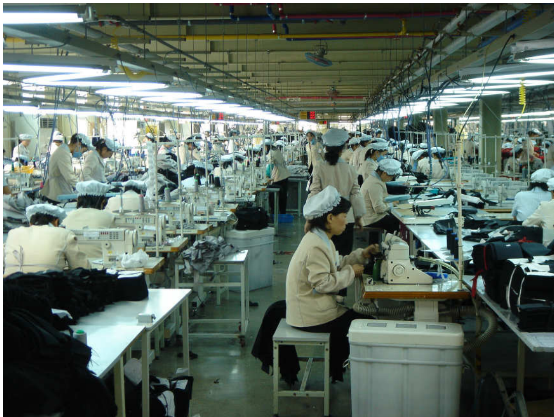
Photo: example of a company in the field of textiles