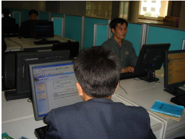
Photo: a visit to the electronic library of Kim Chaek University

There was also some time scheduled for tourist activities, such as a citytour of Pyongyang and attending the spectacular Arirang Massgame.