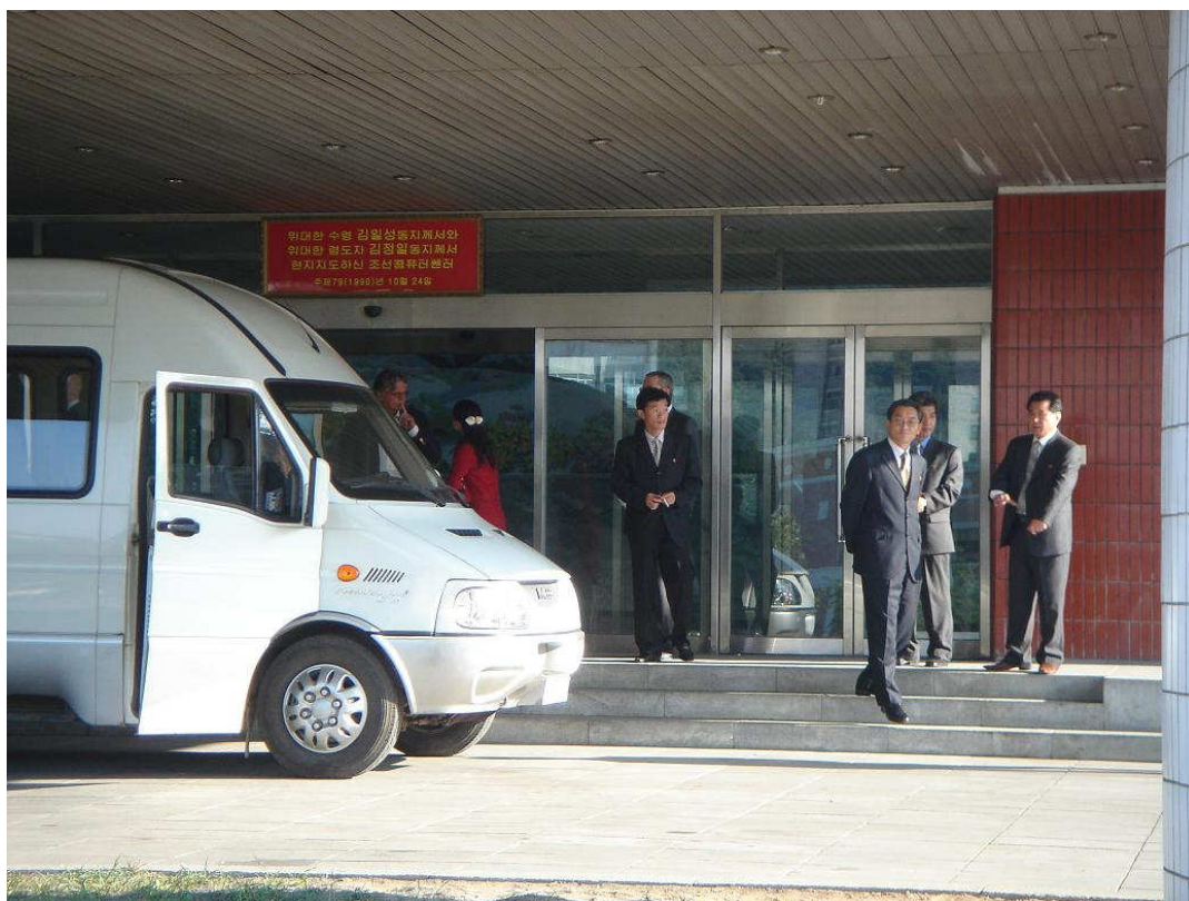
Photo: visit to a company in the field of Information Technology (Korea Computer Center)