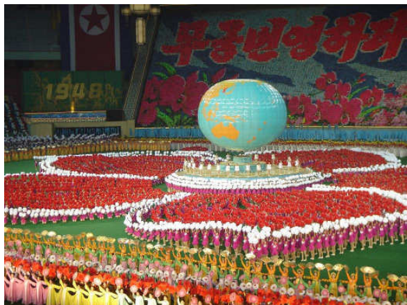
Photo: delegates attending the famous Arirang Massgame