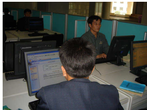
Optional: a visit to a university

There will also some time available for tourist activities, such as a citytour of Pyongyang, an art gallery and (if this takes place during our visit in September) the spectacular Arirang Massgame