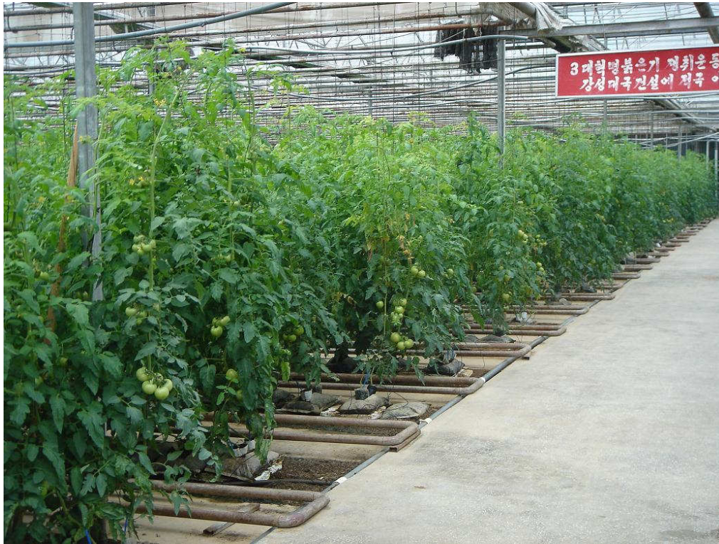
Photo: visiting a company in the field of agribusiness