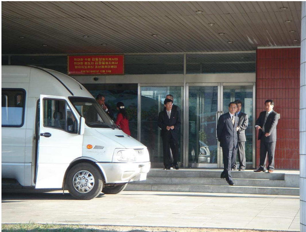
Photo: visits to companies in the field of Information Technology (e.g. KCC) are possible