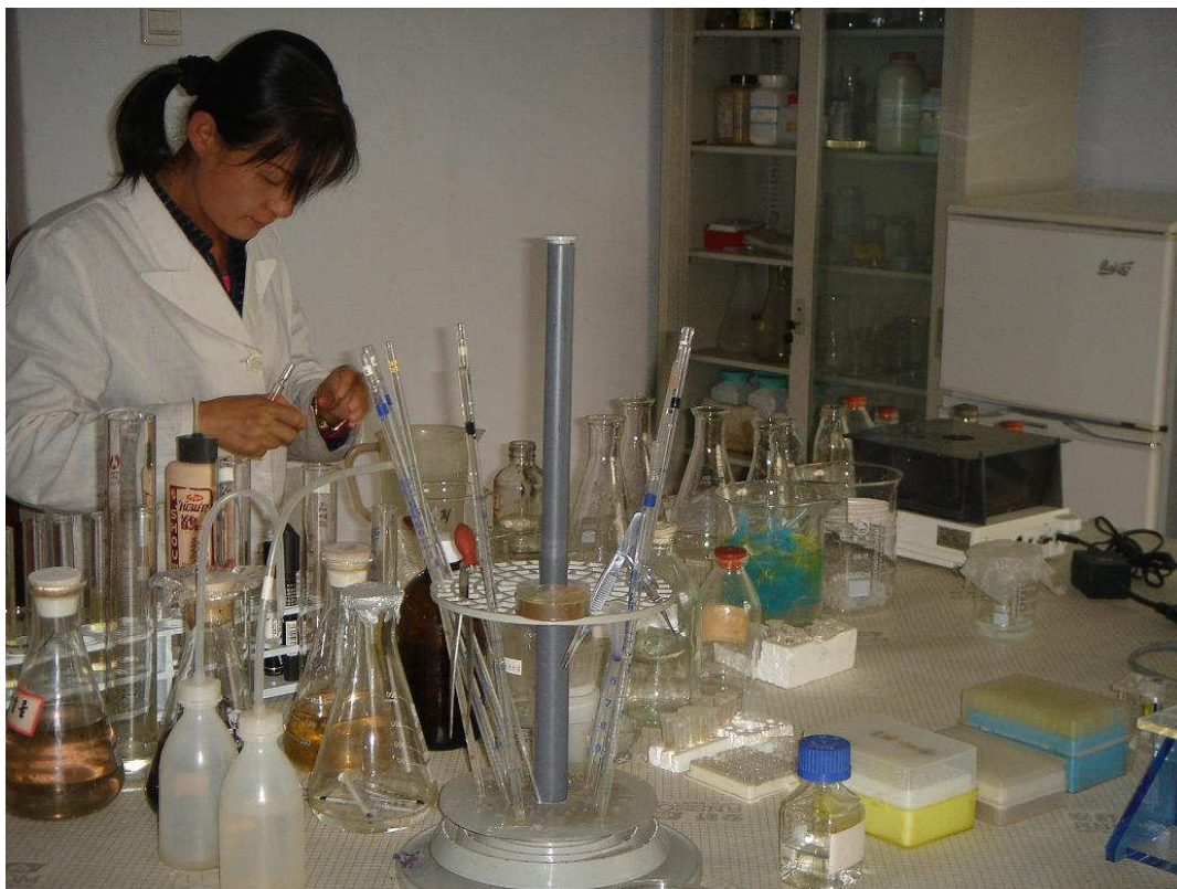
Photo: visiting a company in the field of agribusiness (research labs)