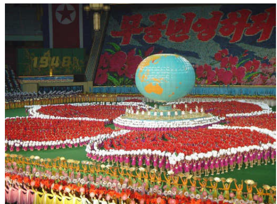
Photo: delegates of a previous mission attending the famous Arirang Massgame