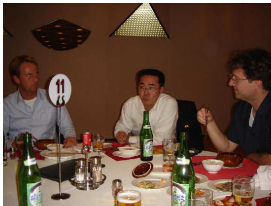
Photo: at a local restaurant - an excellent place for informal business discussions