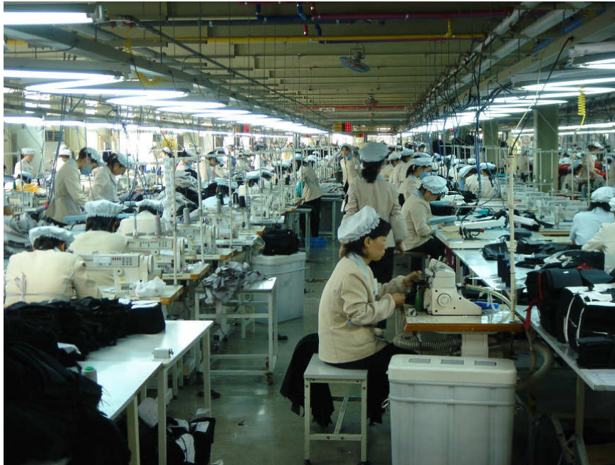
Photo: visits to companies in the field of textiles are possible