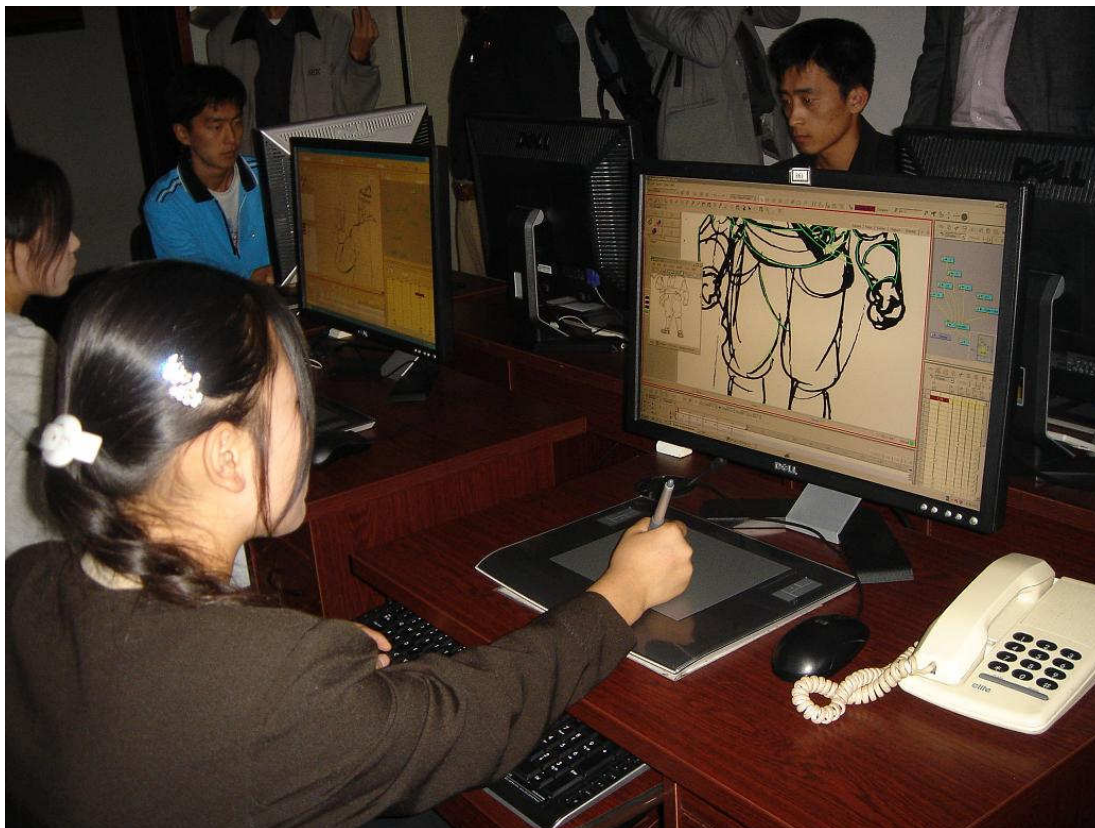
Photo: visits to companies in the field of animation (e.g. SEK) are possible