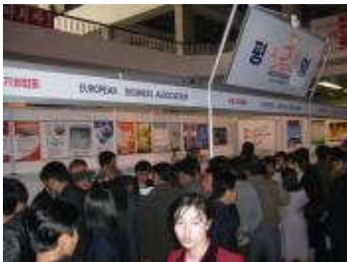
Included: a visit to the Pyongyang International Trade Fair