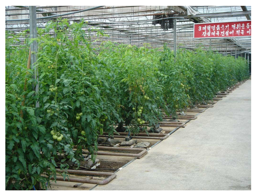
Photo: visits to companies in the field of agribusiness are possible

In the morning, departure from Pyongyang to Beijing. Upon arrival, participants can take a connecting flight to Europe, or decide to spent more time in China.