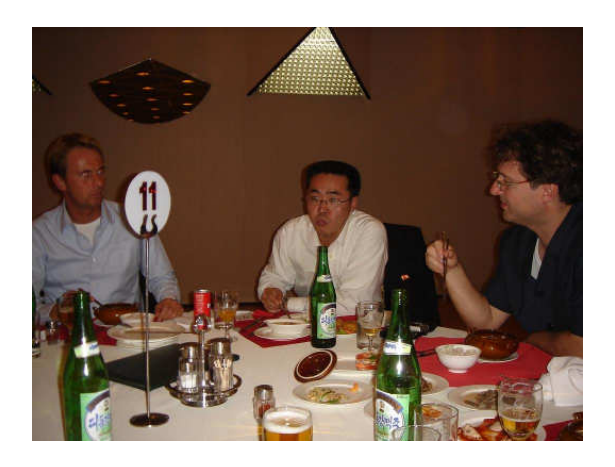
Photo: at a local restaurant - an excellent place for informal business discussions