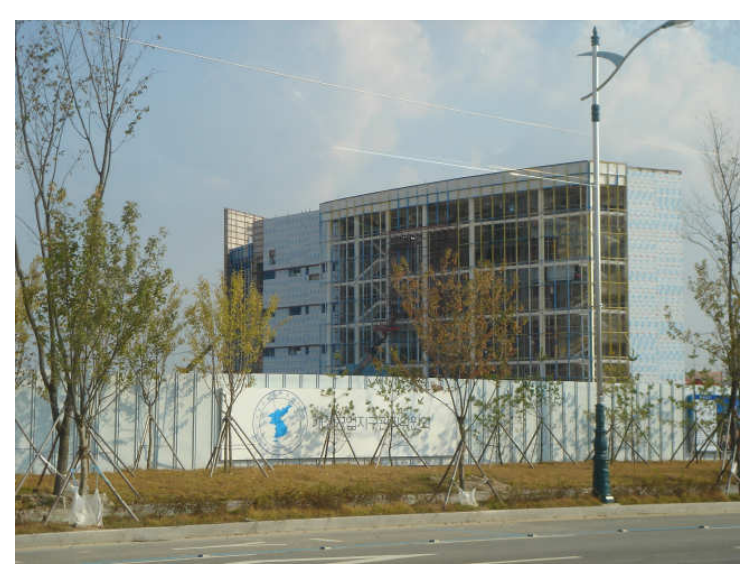
Photo: the rapidly expanding industrial zone at Kaesong (light industry)

Tel.: +31-10-4254172, fax: +31-10-4254317 E-mail: info@gpic.nl, web: <a href="http://www.gpic.nl">http://www.gpic.nl</a>