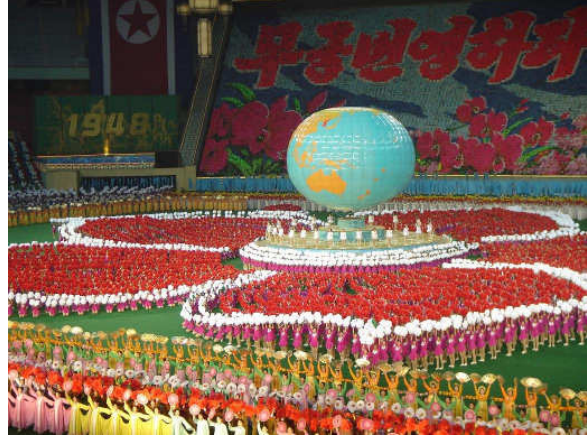
Photo: delegates of a previous mission attending the famous Arirang Massgame