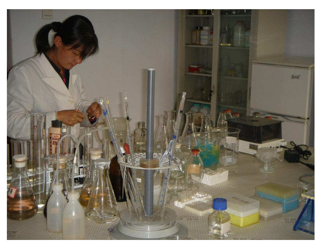
Photo: visits to companies in the field of agribusiness (research labs) are possible